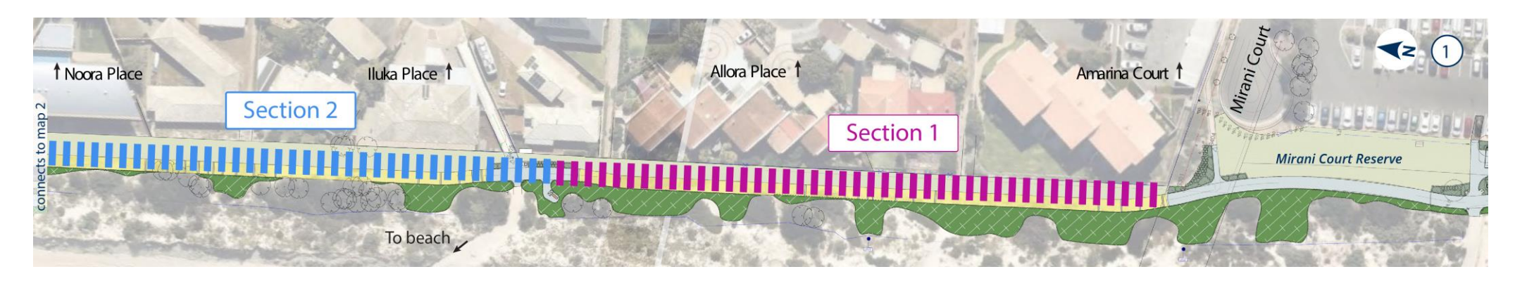
Section 1 - Mirani Court to Iluka Place Section 2 - Iluka Place to Noora Place