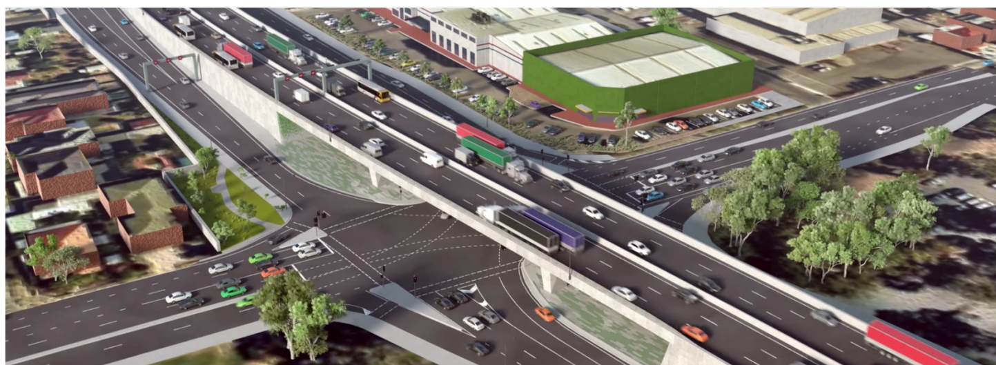
Artist's impression of the Regency Road overpass

If you have a local business that would like to work with the R2P Alliance, please contact us via email or phone using the details below.