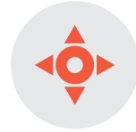
Adelaide City Centre