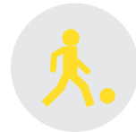
Open space, sport and recreation