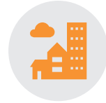
Housing mix, affordability and competitiveness