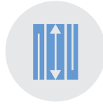
Transit corridors, growth areas and activity centres