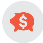
The economy and jobs