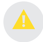
Emergency management and hazard avoidance