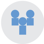
Health, wellbeing and inclusion