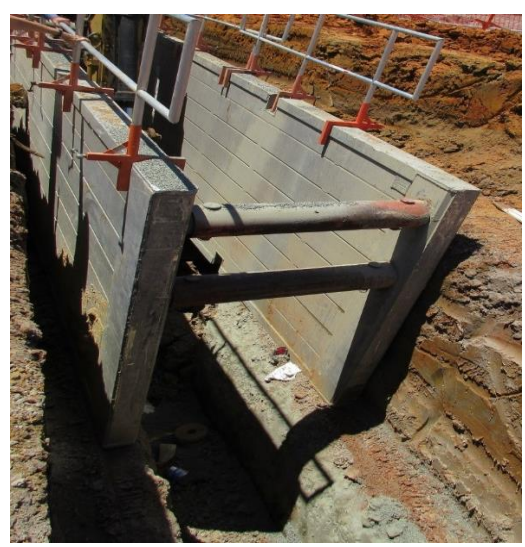
Photograph 1: Unprotected trench below the shoring box.

The collapse of any un-shored section of trench can be caused by a variety of factors including the type of ground, ground-water, rain, and loading applied to the ground. Where a trench has been excavated below a shoring box, the weight of the shoring box can increase the likelihood of the ground collapsing because the trench wall has a load applied within its zone of influence.