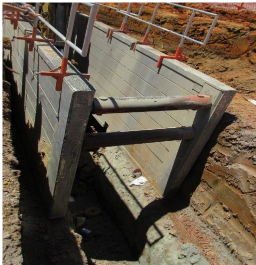
Photograph 1: Unprotected trench below the shoring box.

The collapse of any un-shored section of trench can be caused by a variety of factors including the type of ground, ground-water, rain, and loading applied to the ground. Where a trench has been excavated below a shoring box, the weight of the shoring box can increase the likelihood of the ground collapsing because the trench wall has a load applied within its zone of influence.