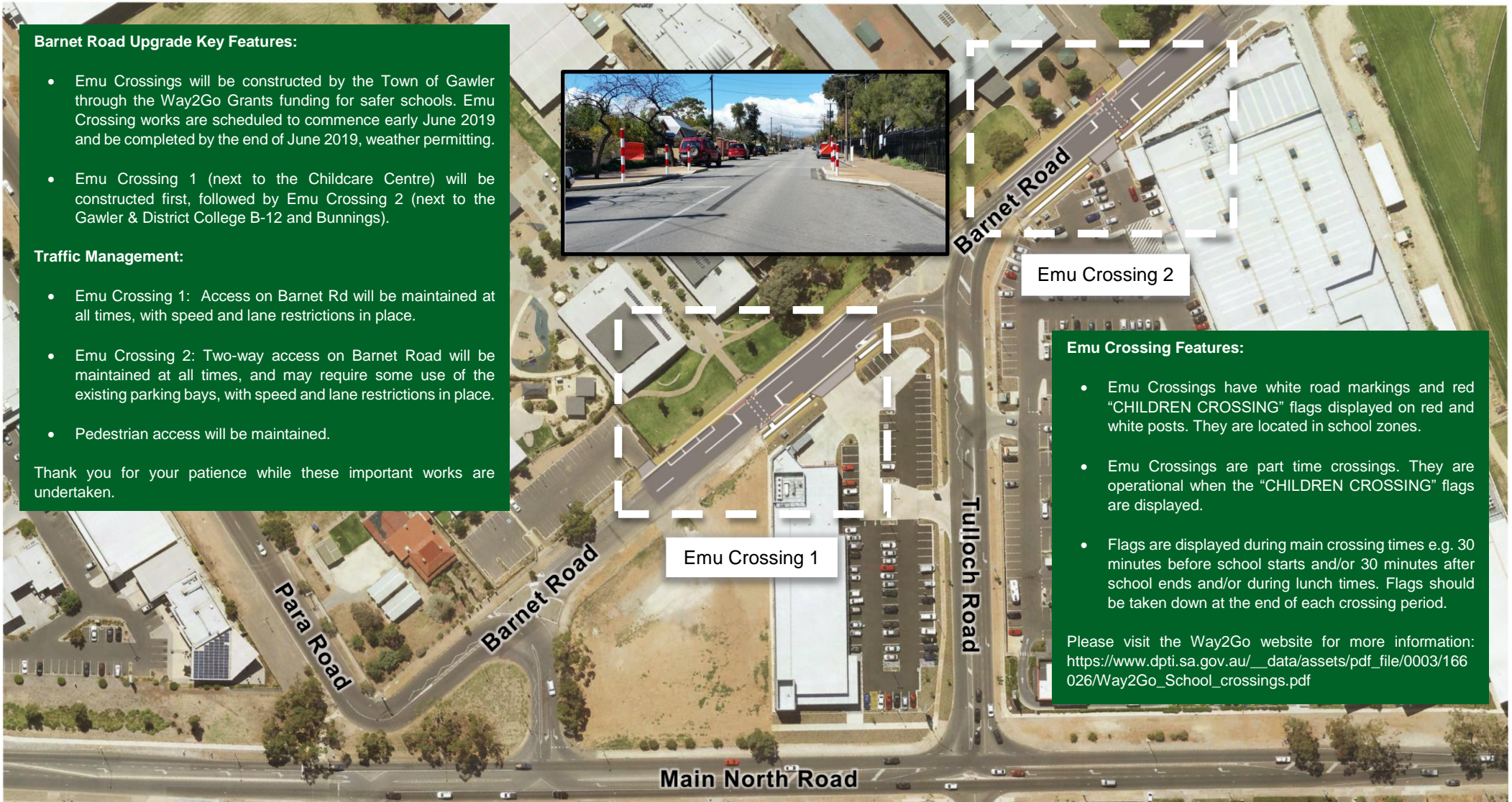
Emu Crossing 2