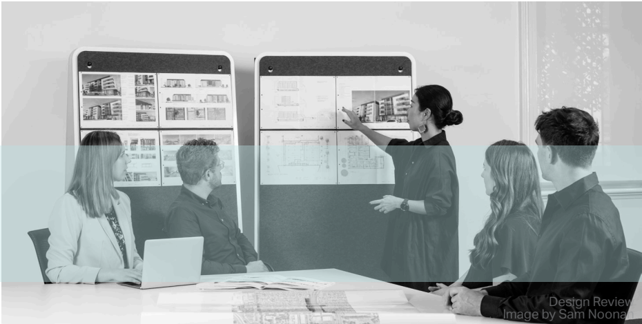
Design Review Image by Sam Noonan