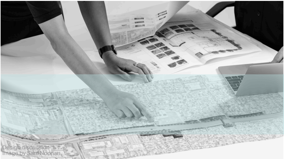
Design discussion