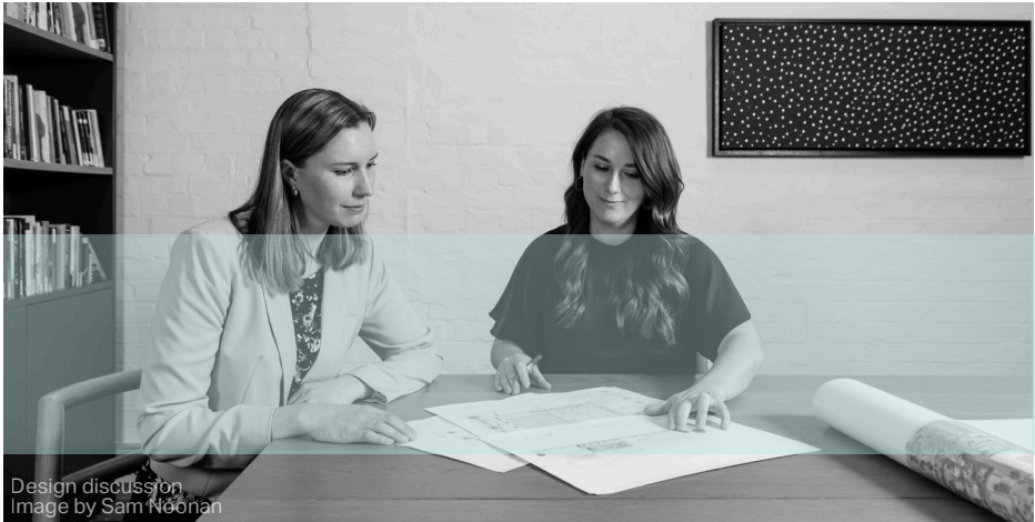
Design discussion