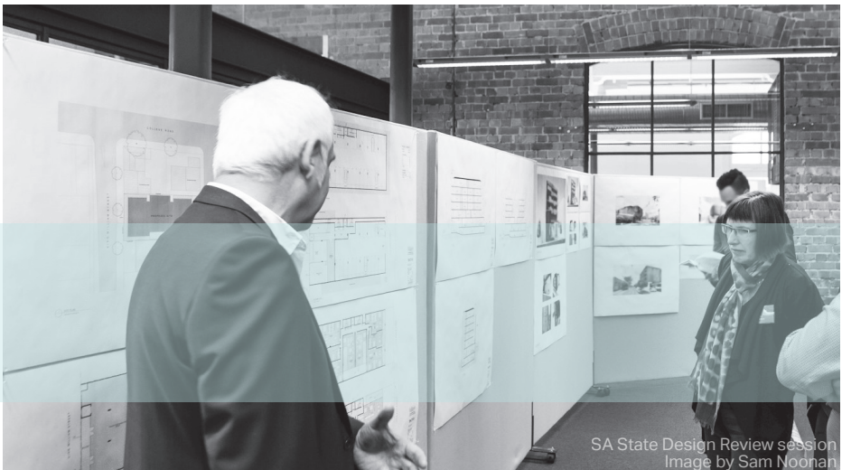
SA State Design Review session

For more information about State Design Review, please visit the ODASA website ( odasa.sa.gov.au ).