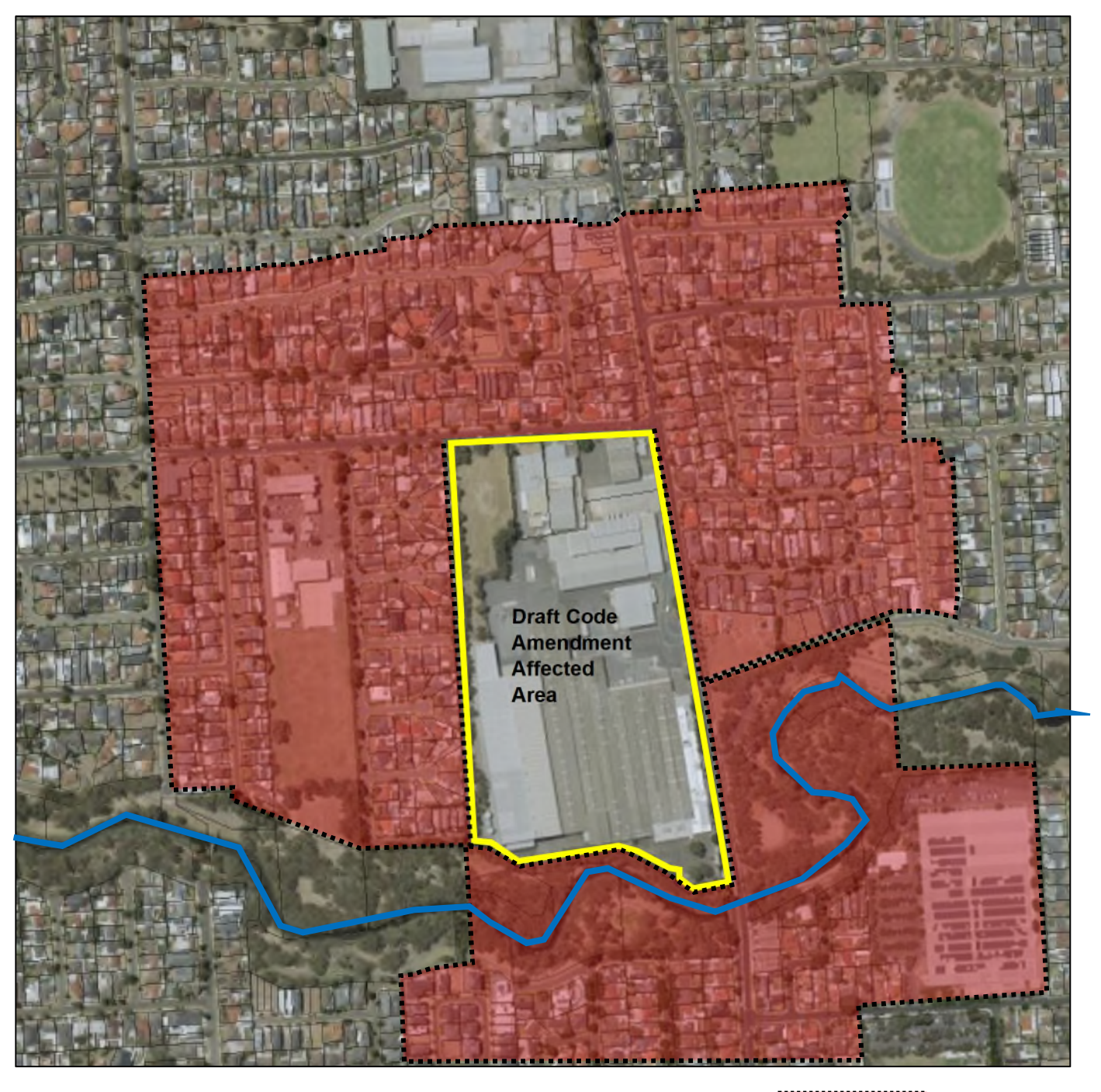
Figure 3 - Indicative location of adjacent land owners/ occupiers directly notified -