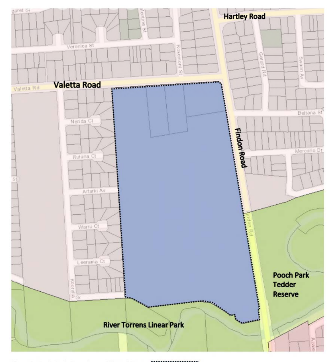
Figure 1 – Draft Code Amendment Affected Area -

The surrounding locality is characterised by low density housing stock. This, along with the area's proximity to transport options, and other services provides the opportunity to consider mixed use outcomes and a higher density residential development. As such, it is proposed that the subject land be investigated for rezoning under the South Australian Planning and Design Code to facilitate a mixed-use environment, which allows for higher residential densities and commercial opportunities.