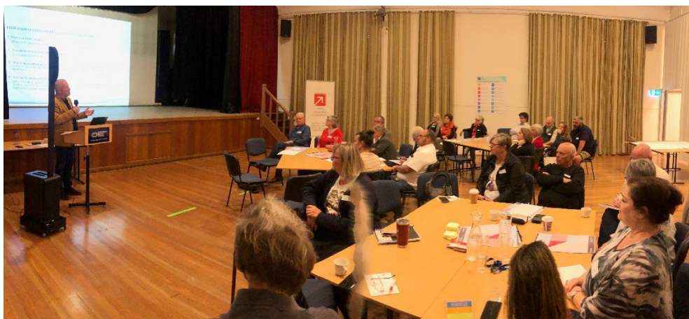
Figure 1: State Planning Commission Chair Craig Holden engaging with Kangaroo Island Visioning Workshop attendees at the Kingscote Town Hall on 9 December 2022

To date pre-workshop engagement activities, designed to inform councils, state agencies and key industry representatives, have been conducted by the Department. The Kangaroo Island Visioning Workshop was held on 9 December 2022, where representatives from the Kangaroo Island Council, key industry organisations, departments and progress associations were present. The workshop was led by the Chair of the State Planning Commission, Planning and Land Use Services (PLUS) and Department of Premier & Cabinet (DPC). Over 30 key stakeholders were in attendance and provided invaluable knowledge of the Kangaroo Island region, by exploring how Kangaroo Island communities will be shaped, live, and grow over the next 30 years. The information collected during the Visioning Workshop will play a critical role in shaping the Kangaroo Island Regional Plan.