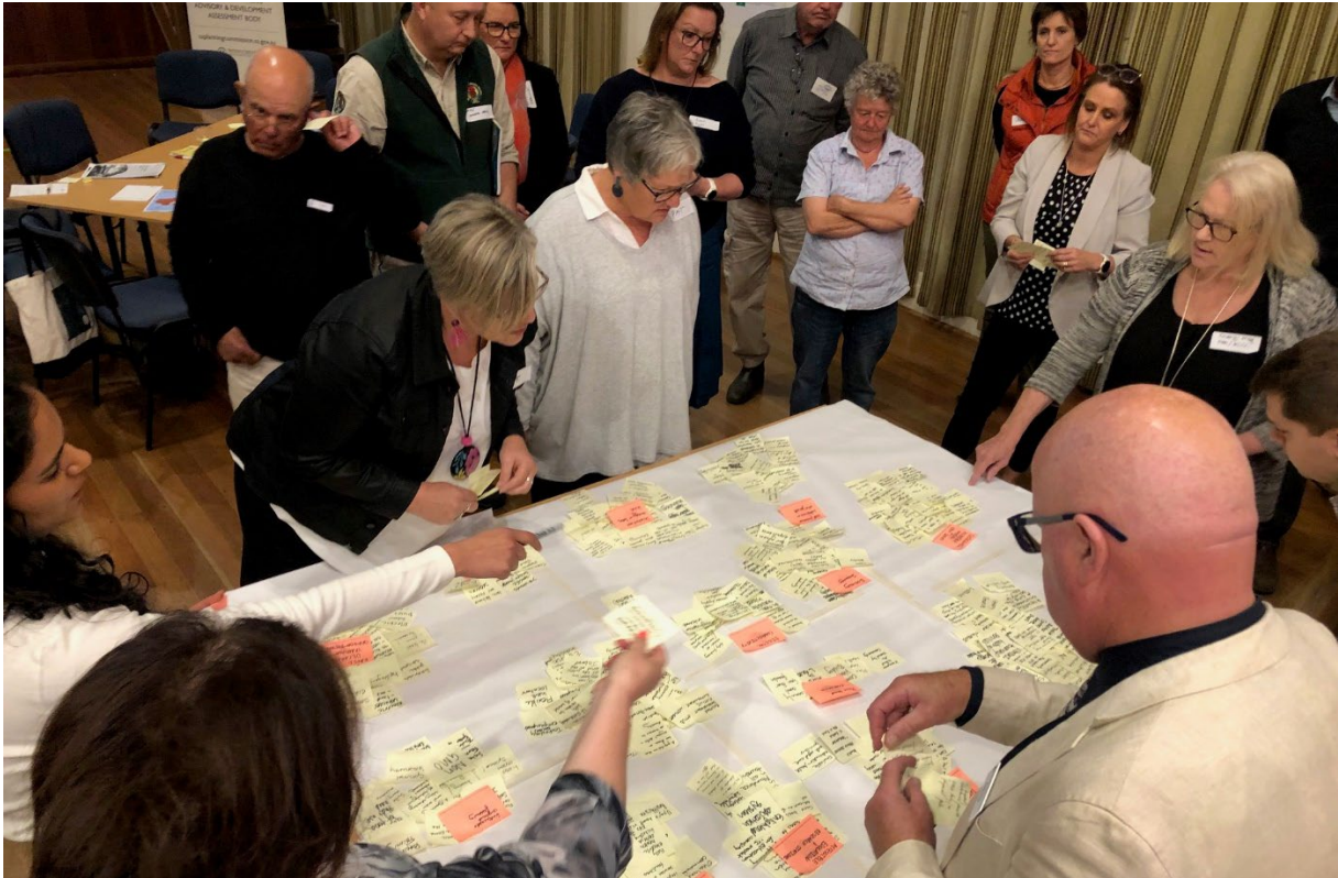
Figure 2: Kangaroo Island Visioning Workshop held at the Kingscote Town Hall on 9 December 2022