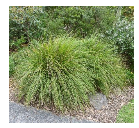
Lomandra longifolia 'Tanika' Common name: Mat Rush Mature size h: 0.5m x w: 0.6m