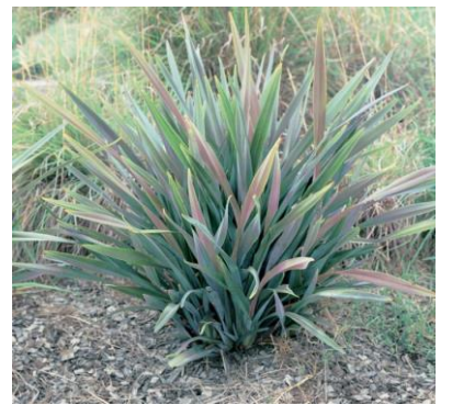
Dianella tasmanica 'TasRed' Common name: Native Flax Mature size h: 0.4 m x w: 0.4 m