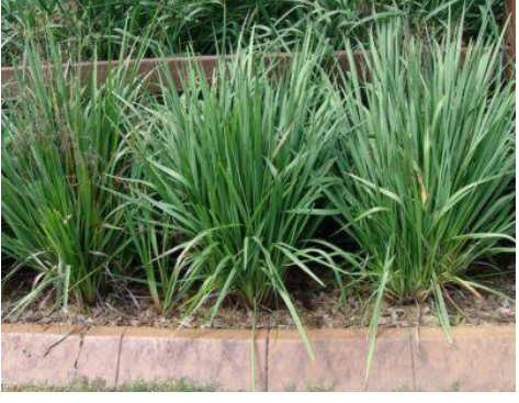
Dianella revoluta var revoluta Common name: Black-anther lilly Mature size h: 0.6 m x w: 1m