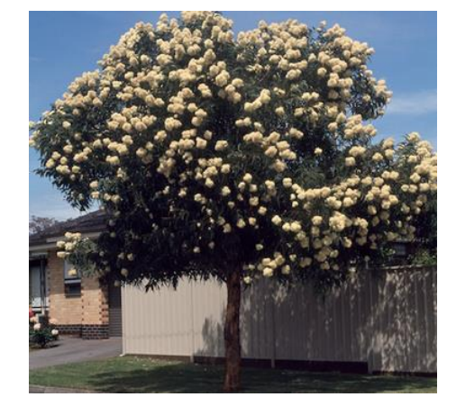
Corymbia eximia "Nana" Common name: Dwarf Yellow Bloodwood Mature size h: 7m x w: 6m