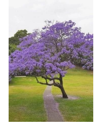
Jacaranda mimosifolia Common name: Blue Jacaranda Mature size h: 10m x w: 8m