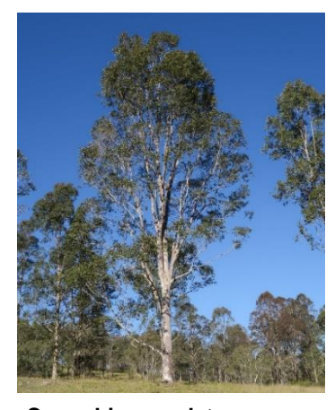
Corymbia maculata Common name: Spotted Gum Mature size h: 22m x w: 10m