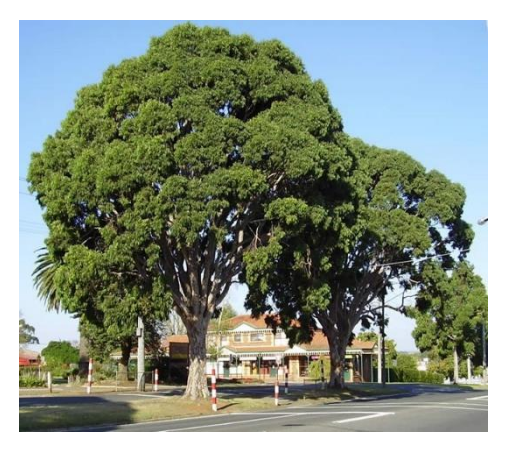
Angophora costata Common name: Smooth-Barked Apple Mature size h: 12m x w:10m