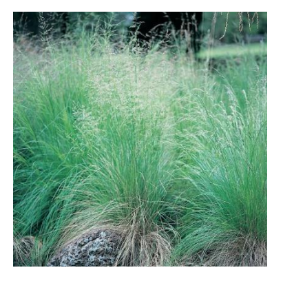
Poa labillardieri Common name: Tussock-grass Mature size h: 0.9m x w: 1m