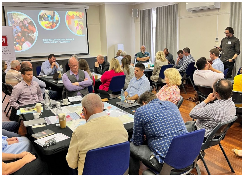
Figure 2: Key stakeholders engaged in a visioning exercise in Port Lincoln on 27 March.