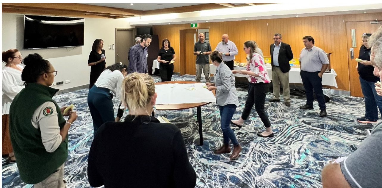
Figure 2: Eyre and Western Visioning Workshop held in Ceduna on 29 March 2023