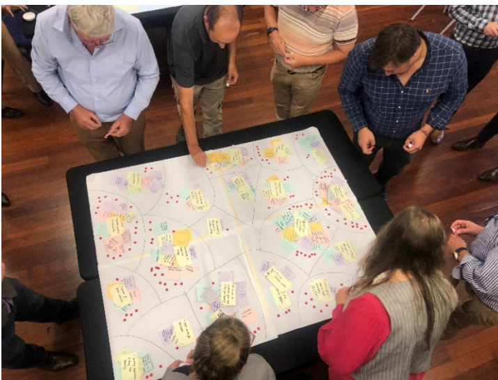
Figure 1: Key stakeholders engaged in the Eyre and Western Visioning Workshop held in Port Lincoln on 27 March.

To date pre-workshop engagement activities, designed to inform councils, state agencies and key industry representatives, have been conducted by the Department. The Eyre and Western Visioning Workshops were held on 27 th (Port Lincoln) and 29 th (Ceduna) of March, where representatives from the local councils, key industry organisations, departments and progress associations were present. The workshops were led by the State Planning Commission, Planning and Land Use Services and Department of Premier and Cabinet. 45 key stakeholders were in attendance and provided invaluable knowledge of the Eyre and Western region, by exploring how the various communities will be shaped, live, and grow over the next 30 years. The information collected during the Visioning Workshops will play a critical role in shaping the Eyre and Western Regional Plan.