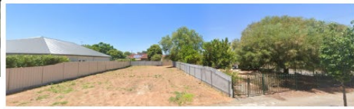
STREETVIEW FROM HERBERT ST LOOKING EAST TO PROPOSED ACQUISITION & EXISTING RESERVE