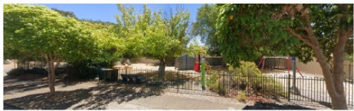
STREETVIEW FROM PECKHAM ROAD LOOKING NORTH TO EXISTING RESERVE