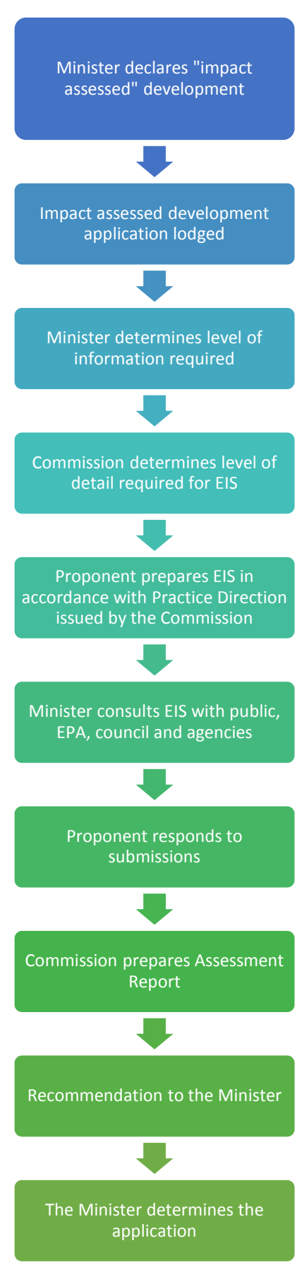
Figure 1. Steps in impact assessed development application process