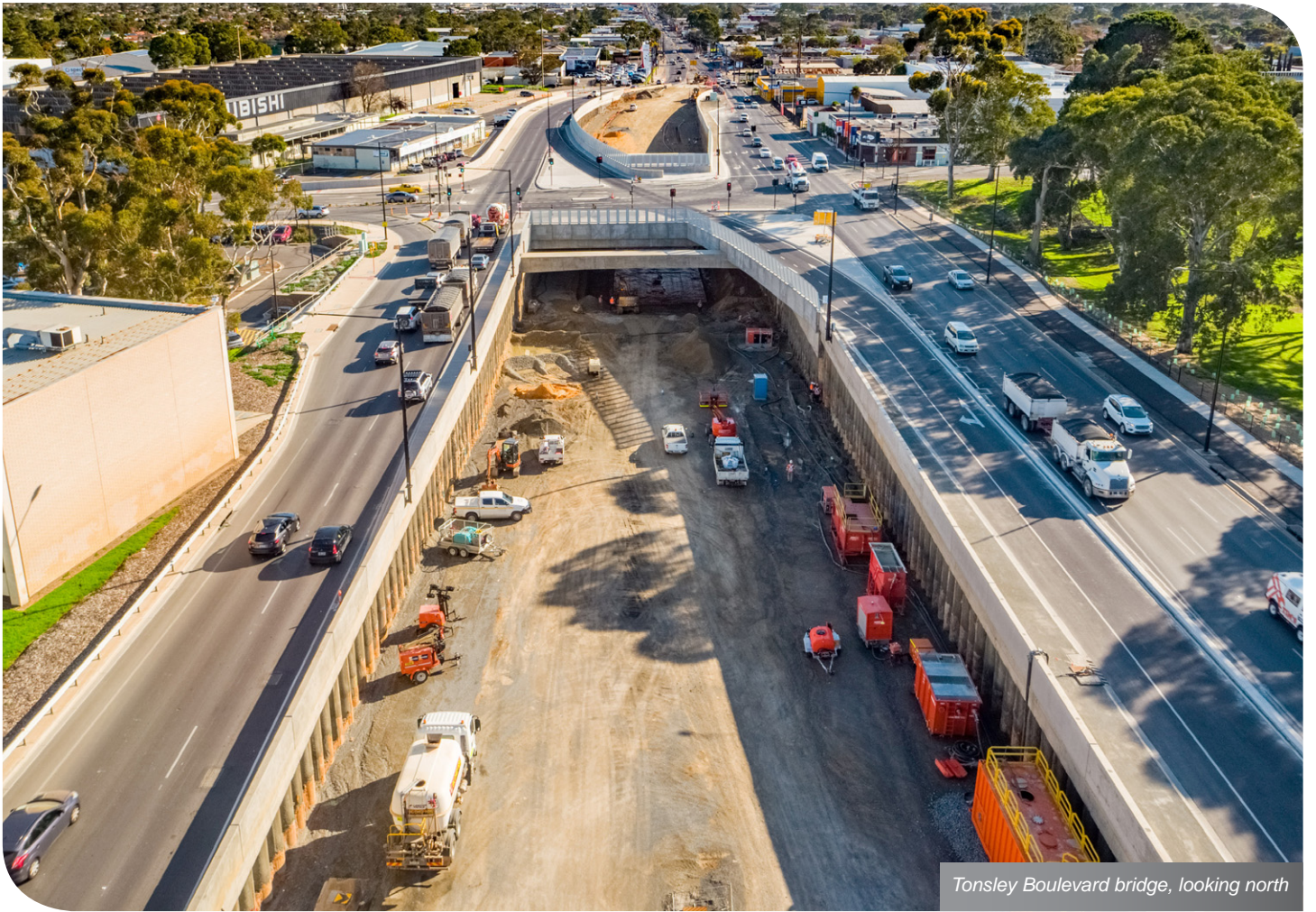
Tonsley Boulevard bridge, looking north