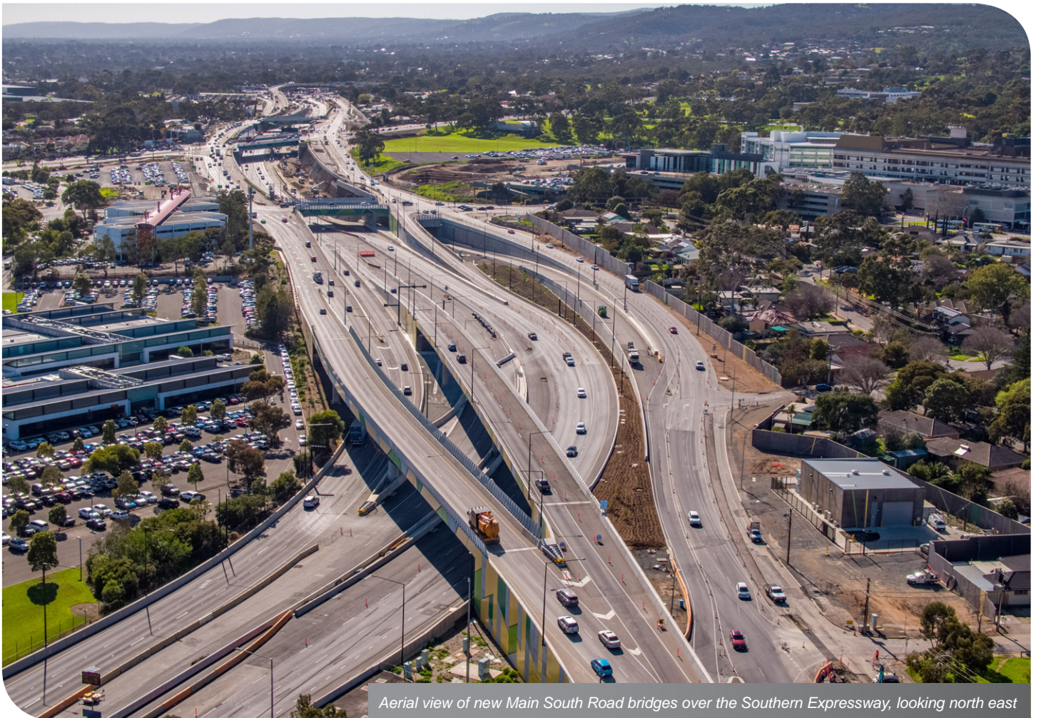
Aerial view of new Main South Road bridges over the Southern Expressway, looking north east