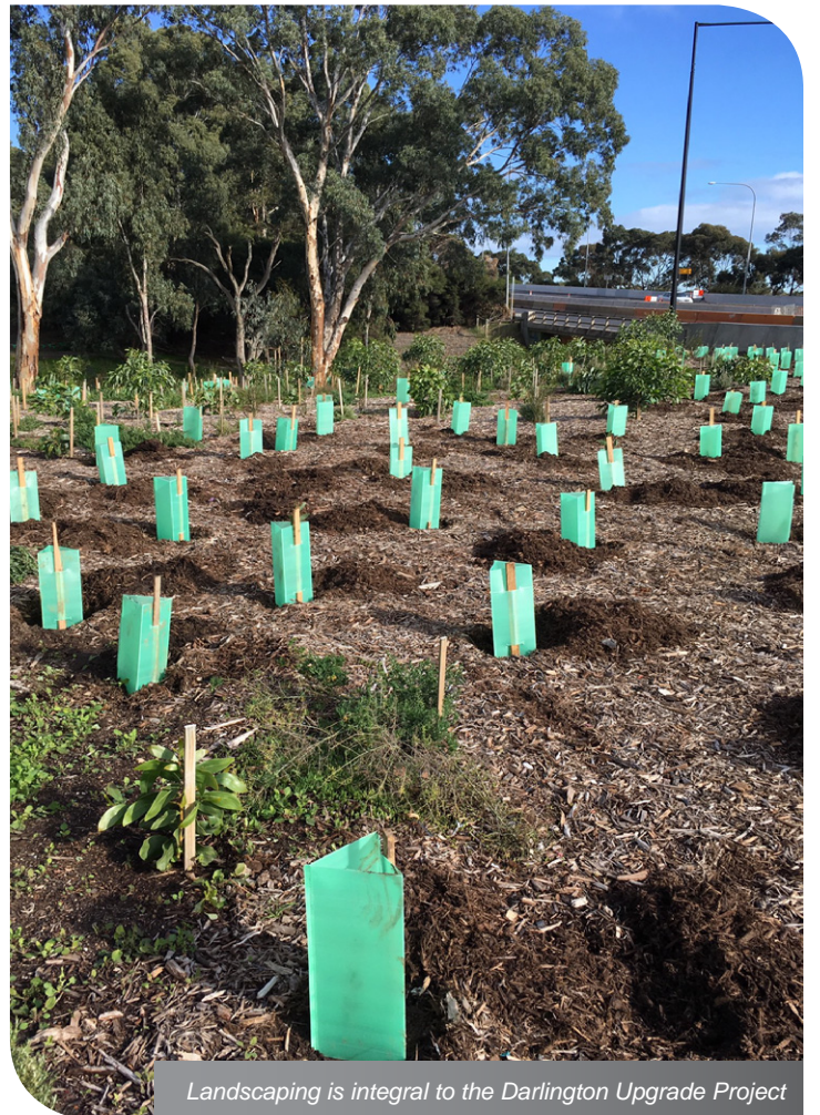
Landscaping is integral to the Darlington Upgrade Project

We are grateful to local community group Friends of Warriparinga who donated seeds from plants within the Warriparinga wetlands to the project team. The seeds were then propagated by Greening Australia and more than 1,400 plants were produced and then used in landscaping in adjacent public open spaces.