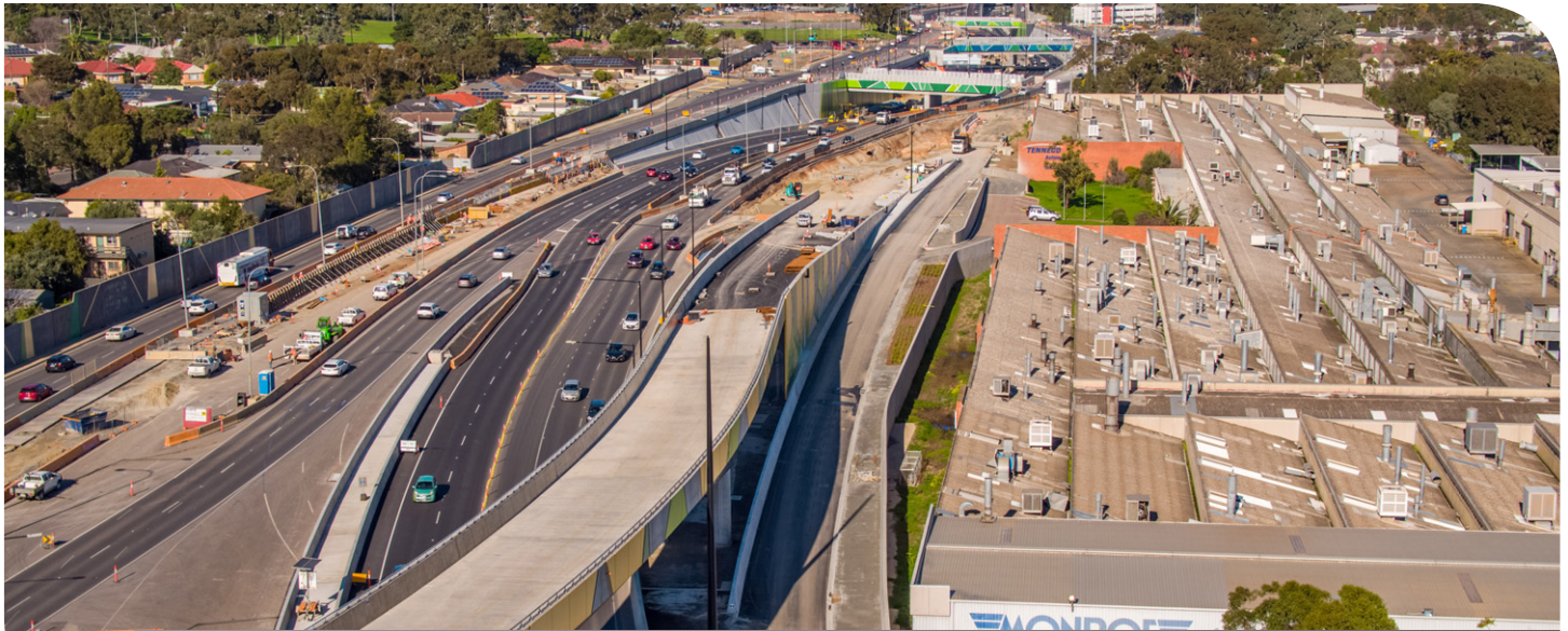
Ayliffes Road bridge in foreground with Sutton Road/Mimosa Terrace, Sturt Road and Flinders Drive bridges in background, looking south