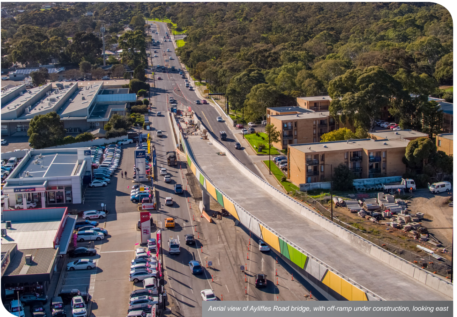
Aerial view of Ayliffes Road bridge, with off-ramp under construction, looking east