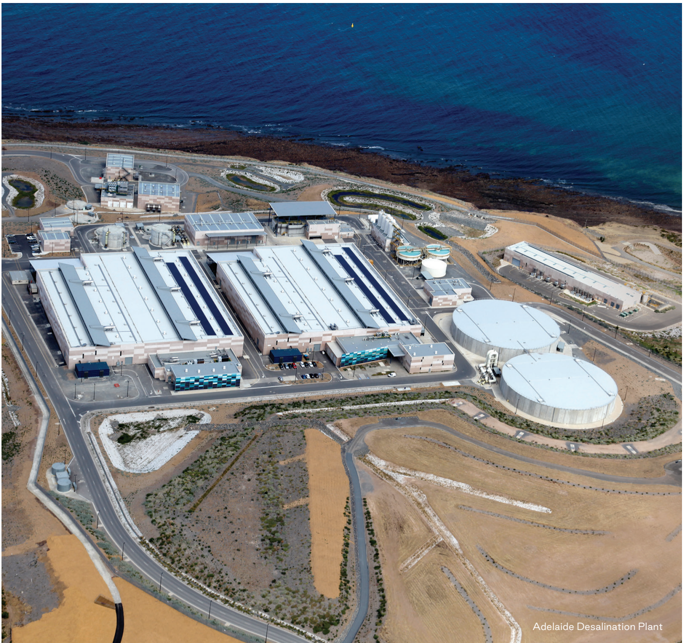
Adelaide Desalination Plant