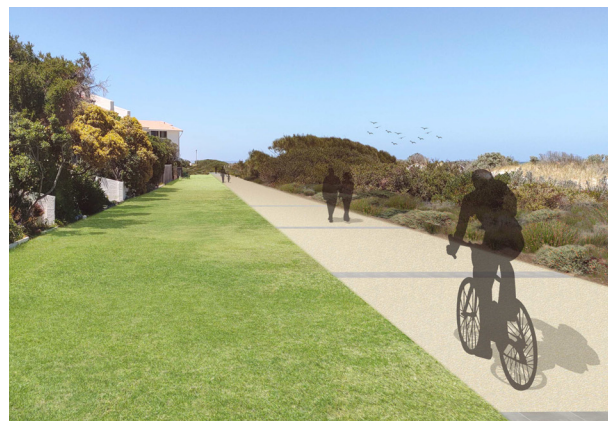
View 1: Visualisation north of Mirani Court (Semaphore Park) looking south. Artistic impression only. Vegetation shown at maturity.