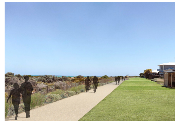
View 2: Visualisation south of Mirani Court (West Lakes Shore) looking north. Artistic impression only. Vegetation shown at maturity.