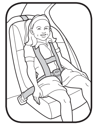
Booster seat with child safety harness.