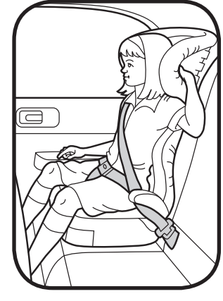
Booster seat with lap-sash seatbelt.

Children in this age group must not travel in the front seat of a vehicle that has two or more rows of seats unless all the other back seats are occupied by children who are also under 7 years.