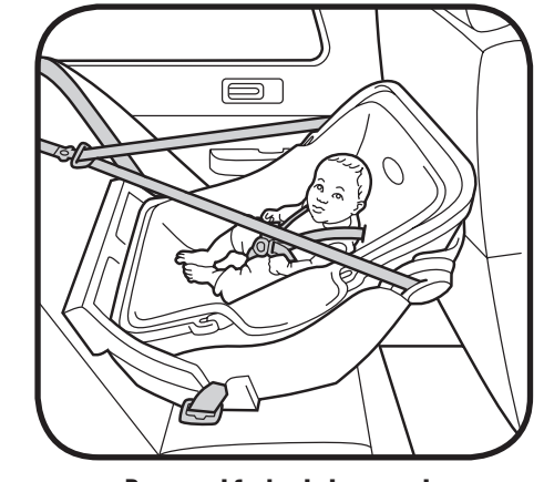
Rearward facing baby capsule.

The restraint must be properly installed and adjusted to fit the child's body.