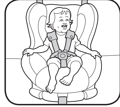
Forward-facing child safety seat with an inbuilt harness.

Children in this age group must not travel in the front seat of a vehicle that has two or more rows of seats.