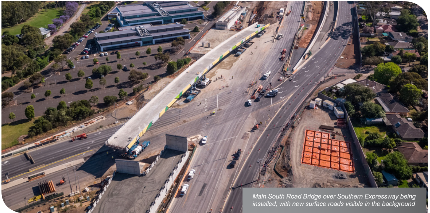
Main South Road Bridge over Southern Expressway being installed, with new surface roads visible in the background