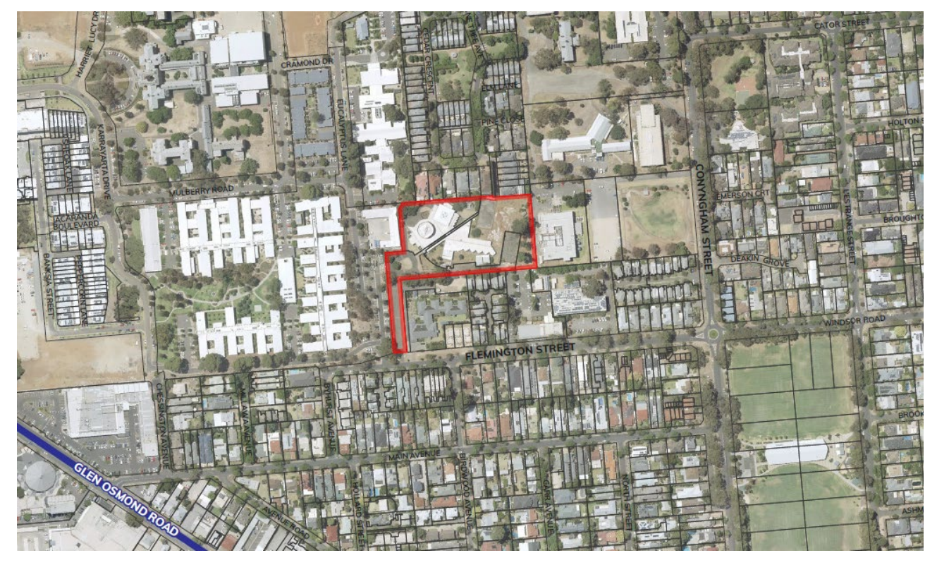
Figure 1 Subject land