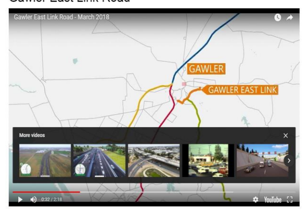
(Picture: Above - GELR Fly-through. Below - Taken from Information Day of community members and project team.)