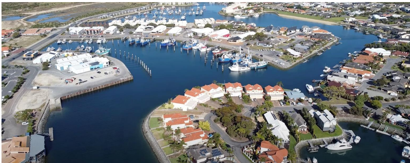
Lincoln Cove Marina

Three existing timber walkway promenades, including handrailing, will be replaced with marine grade fibre reinforced composite polymer (FRP). FRP is highly resistant to the corrosive effects of saltwater, and its use in this project will ensure the promenades are safe and accessible for years to come.