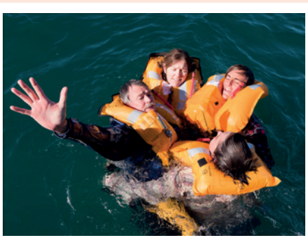
Form a huddle to stay together and minimise loss of body heat

The loss of core body temperature in vital organs such as the heart, lungs and kidneys can cause death quickly. The risk is increased if the person is anxious, hungry, exhausted or mentally low.