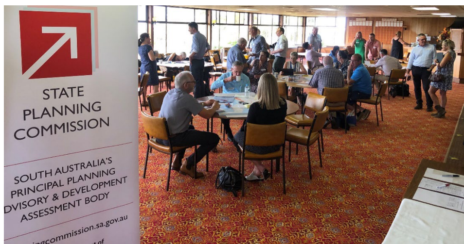
Figure 1: Key stakeholders engaged in the Maitland Visioning Workshop held on 24 February 2023.

To date pre-workshop engagement activities, designed to inform councils, state agencies and key industry representatives, have been conducted by the Department. The Yorke Peninsula & Mid North Visioning Workshops were held on the 23 rd (Clare) and 24 th of February (Maitland), where representatives from the local councils, key industry organisations, departments and progress associations were present. The workshops were led by the State Planning Commission, Planning and Land Use Services and Department of Premier & Cabinet. 54 key stakeholders were in attendance and provided invaluable knowledge of the Yorke Peninsula & Mid North region, by exploring how the various communities will be shaped, live, and grow over the next 30 years. The information collected during the Visioning Workshops will play a critical role in shaping the Yorke Peninsula & Mid North Regional Plan.