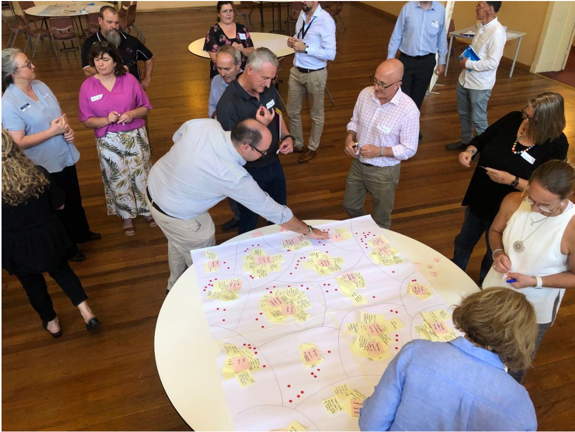
Figure 2: Yorke Peninsula and Mid North Visioning Workshop held at the Clare Town Hall on 23 February 2023