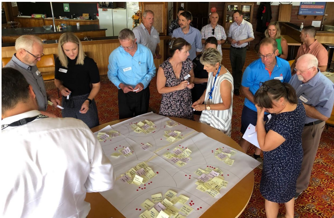
Figure 2: Yorke Peninsula and Mid North Visioning Workshop held at the Maitland Golf Club on 24 February 2023