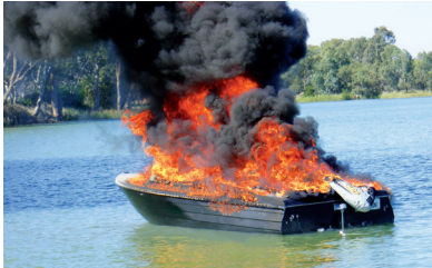
LPG can be the most dangerous substance on boats

For more information, contact the Office of the Technical Regulator ( refer chapter 13 ).