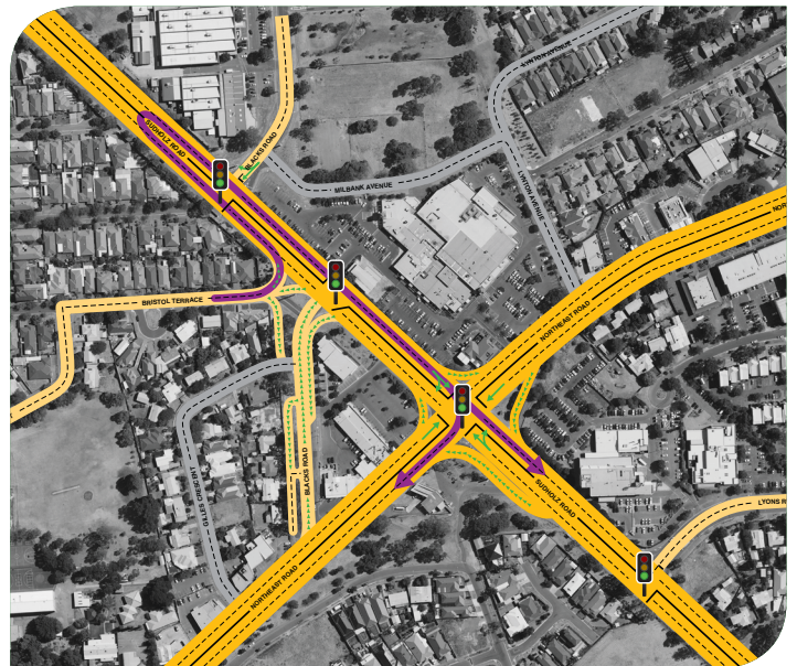
From Bristol Terrace to CBD and Paradise Interchange