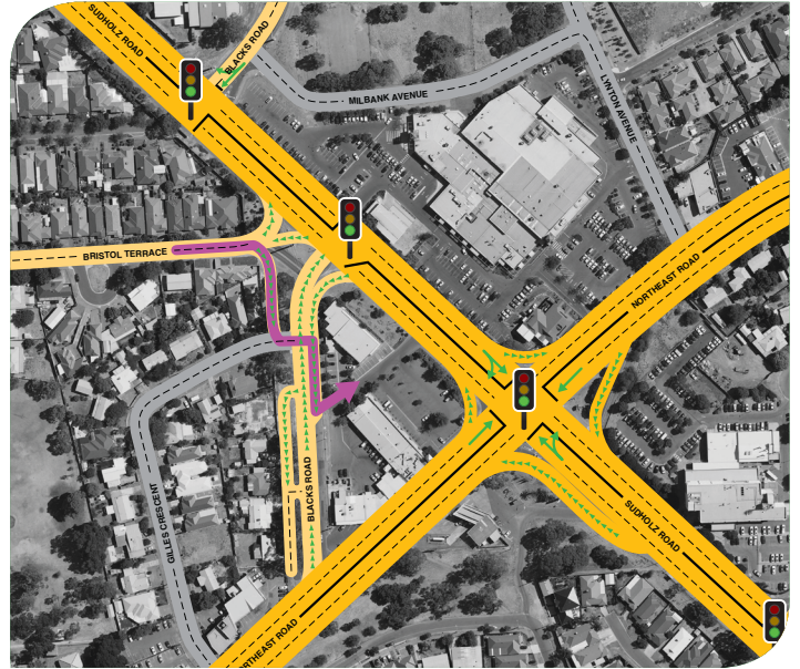
From Bristol Terrace to Gilles Plains Shopping Centre Subject to Council endorsement