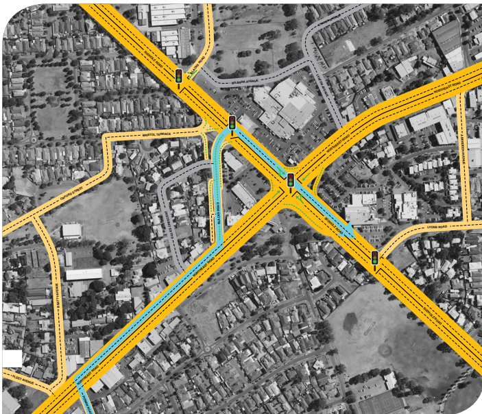
From Pitman Road/CBD to Paradise Interchange