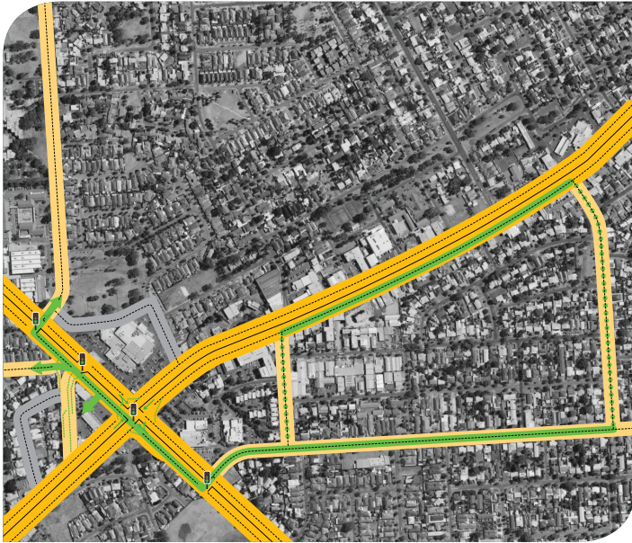
From Modbury to the Plains Shopping Centre, Bristol Terrace or the Gilles Plains Shopping Centre via Tarton Road or Aberdeen Avenue