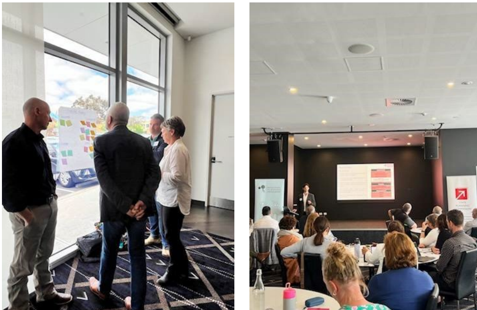
Figure 3 & 4: Key stakeholders engaged in the Murray Bridge Visioning Workshop held on 31 October 2024.