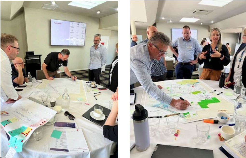
Figure 1 & 2: Key stakeholders engaged in the Berri Visioning Workshop held on 21 October 2024.